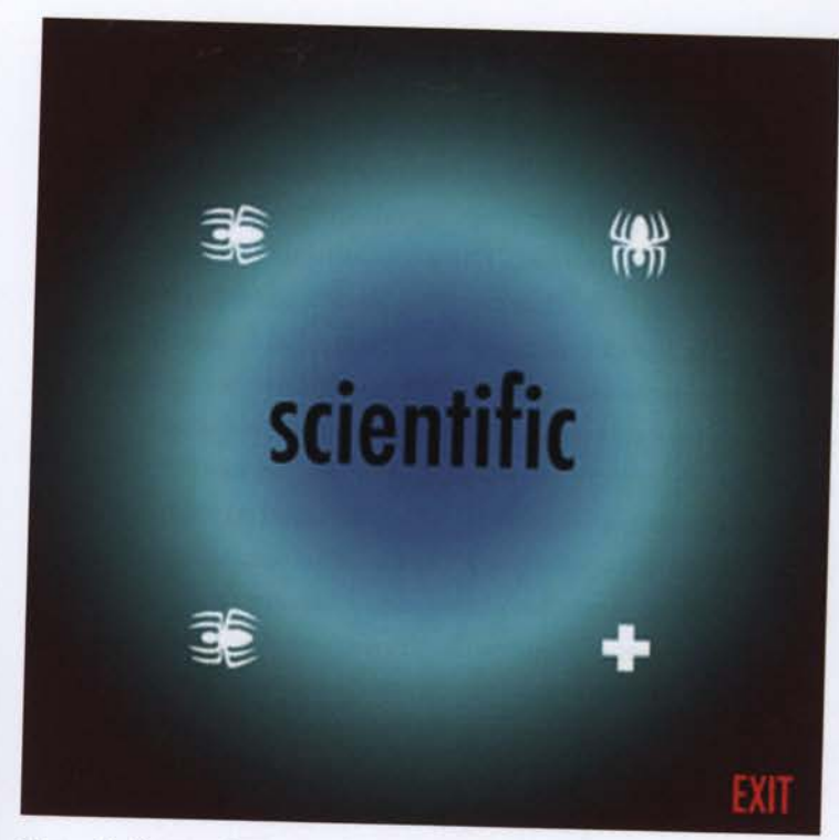
Figure 8. Screen shot, Project for Tachistoscope

In Poundstone's Flash remediation of the tachistoscope, a pulsating looping soundtrack provides the aural background for flashing words narrating the story of an immense abyss that suddenly rips open at a highway construction site, swallowing several pieces of heavy machinery and, tragically, some doomed workers. Underlying the words are easily recognized iconic white images whose relation to the verbal narrative is unclear, although some of them seem to suggest the conjunction of capitalism (money bags), belief (crosses), and consumption (knife and fork). Yet another information stream is provided by a pulsing blue circle of color surrounding the verbal and iconic images, its hypnotic effect intensified by synchronization with the sound loop. As the narrative progresses, fleeting phenomena appear. Golden spheres wander across the visual field, apparently at random, and words begin flashing underneath the black script and underlying white images at a pace too fast to be positively decoded, although not so fast that their presence is entirely unrealized. As the kinds and amounts of sensory inputs proliferate, the effect for verbally oriented